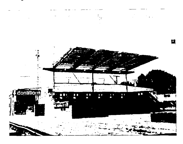
Figure 4. Performance Space<sup>22</sup>