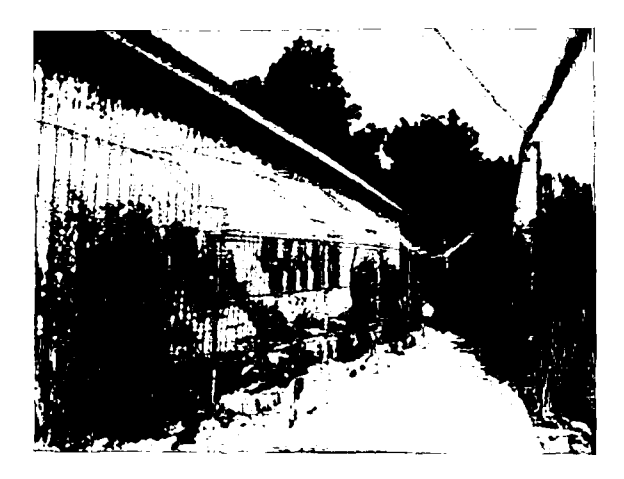
Figure 3. Meditation Garden<sup>21</sup>

A barren alleyway was once the only connection between four halfway houses and the job training and rehabilitation center which serves the residents. Our students first created small installations (altars / alters) inspired by the success stories and testimonials of residents who had graduated from the rehab program. These installations grace the walls of a meditative garden called the Signposts of Grace. Residents now can stop, rest and reflect upon the struggles and victories of their lives. The city selected the project as one of only a handful to fund as a pocket park.