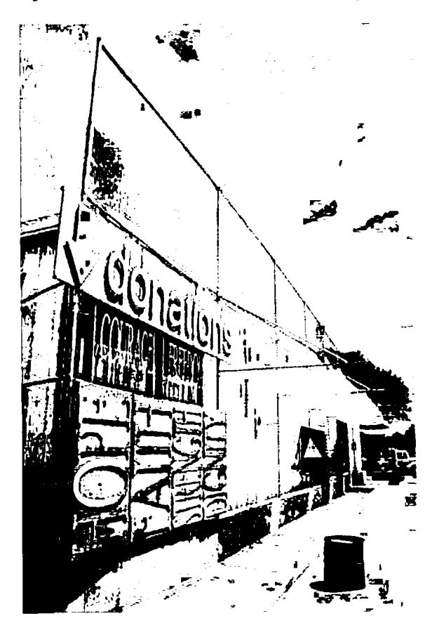
Figure 2. Donation Store- After<sup>20</sup>