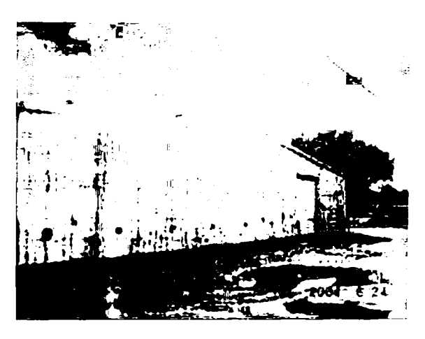
Figure 1. Donation Store Site- Before our Project<sup>19</sup>